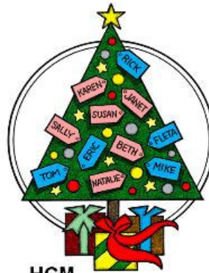
HCM GIVING TREE

Once again, this Holiday season, St. Paul will support HCM with gifts.